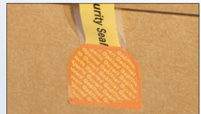
... which remains visible even if the seal is re-closed.