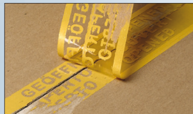
When the SecuritySeal is opened, a warning appears, ...