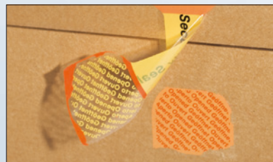
When opened, an individually customised warning appears, ...